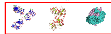
Infectious disease-associated biomarkers: New targets